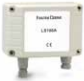
LS160A RH% probe, scale range from 0 to 100 %RH.