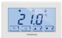
CH120RF WIRELESS TOUCHSCREEN ROOM THERMOSTAT

CH180RFRWIFI kit is preset and ready-to-use and it can be also expanded with the following accessories: