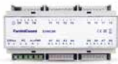
EVWC8R WIRING CENTER SUITABLE FOR 8 CHANNELS