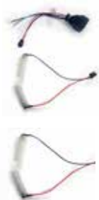
1598089 STAND-ALONE POWER SUPPLY KIT