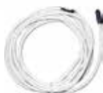
EC19 FLOOR TEMPERARURE PROBE