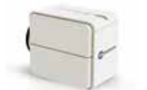
O60RF WIRELESS RADIATOR ACTUATOR