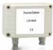
LS160A RH% probe, scale range from 0 to 100 %RH